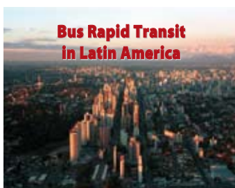
Bus Rapid Transit in Latin America

Building on its previous work in 1997, 2000 and 2003, TAS once again surveyed authorities running and developing projects in 2007, and our report Park and Ride Great Britain 2007 presents the results. It presents an analysis of schemes and expenditure, looking at both the extent and type of provision, including benchmarking, case studies and the first ever estimates of national patronage by P&R.